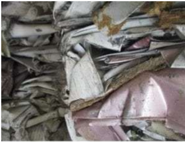
Dirt and Debris