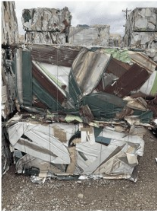
OPS – Baled with AT LEAST 4 wires