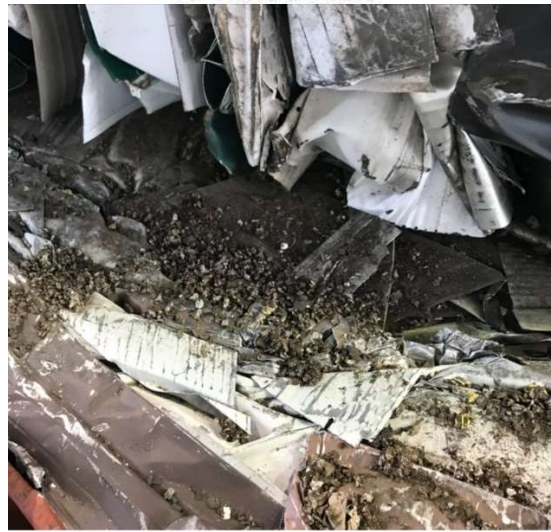
Dirt and Debris