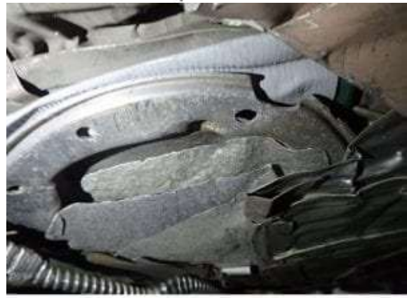
Material Exceeding 3/16 Thickness