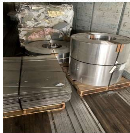
OPS – Coils