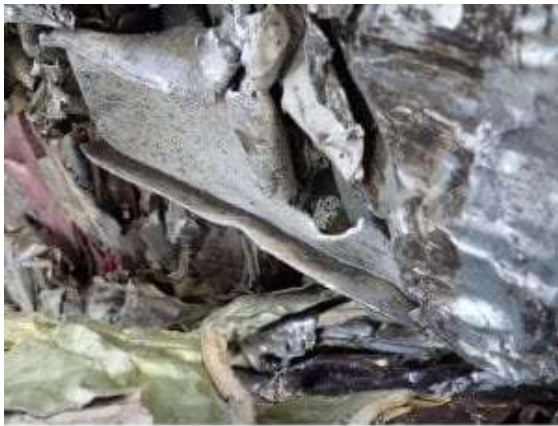
Material Exceeding 3/16 Thickness