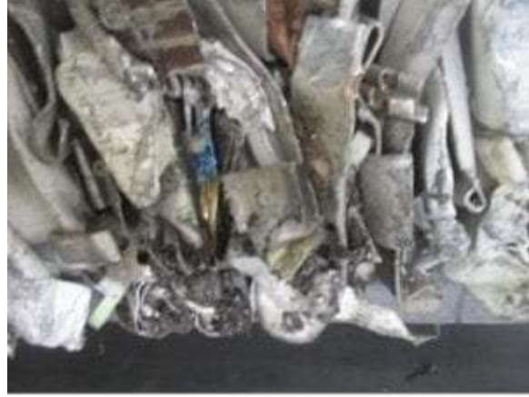
Dirt and Debris