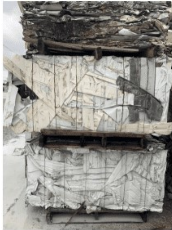
OPS – Baled with wires and pallet