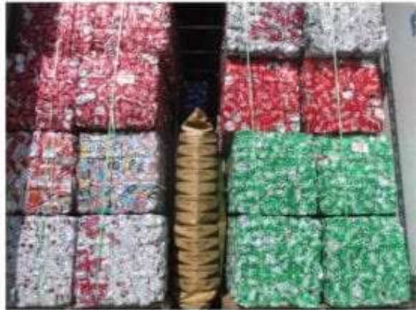
Improper Banding/Stack height