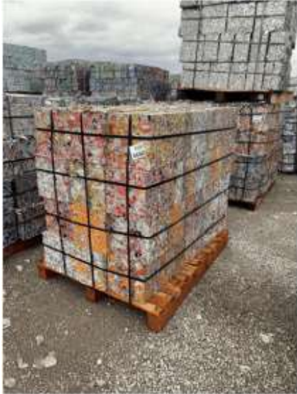
CLS-3 – Steel Bands and Pallet