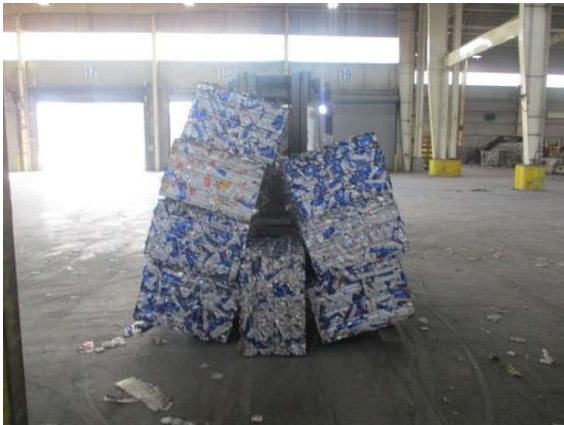
Multiple Small Bales Not Banded Together