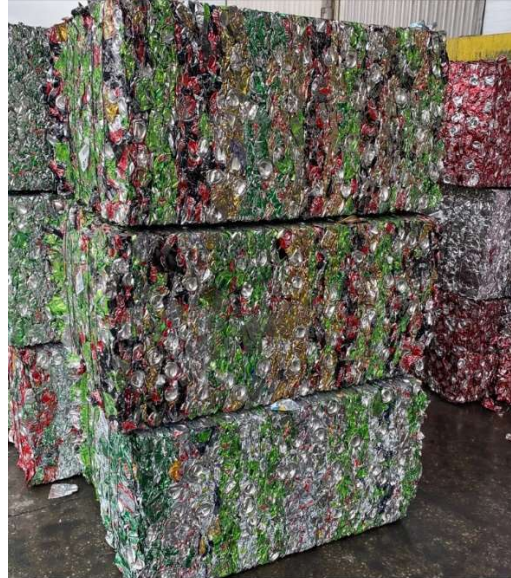
Class 3 Bales