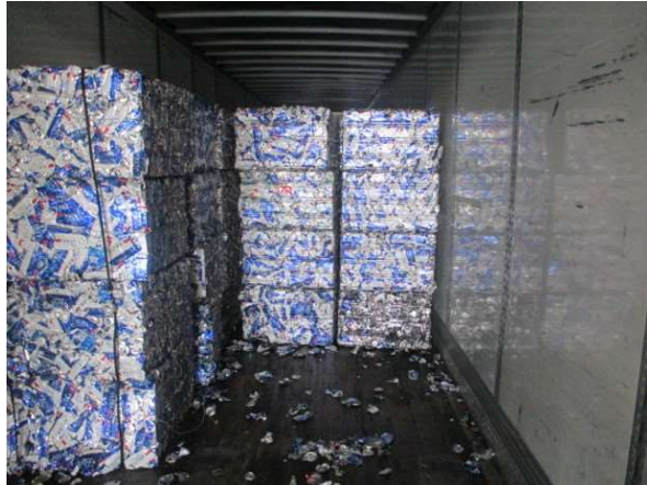
Multiple Small Bales Not Banded Together