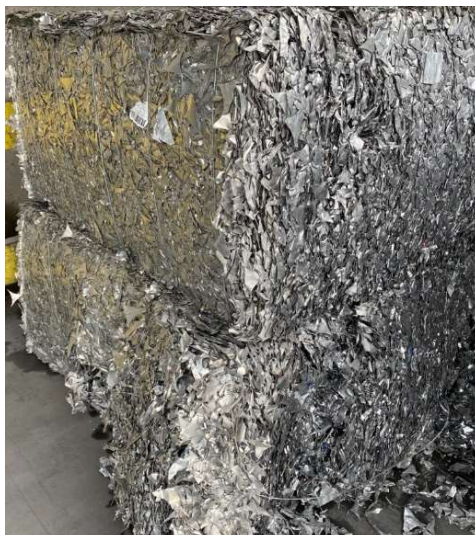
Class 1 Bales